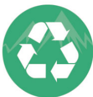
COLD STORE RECYCLING