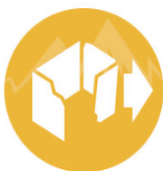
COLD STORE REMOVAL