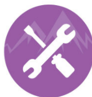
SERVICE & MAINTENANCE