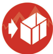
COLD STORE INSTALLATION

So whether it be an installation, removal or disposal of goods, Iceline Yorkshire are sure to exceed your needs going above and beyond for customer satisfaction.